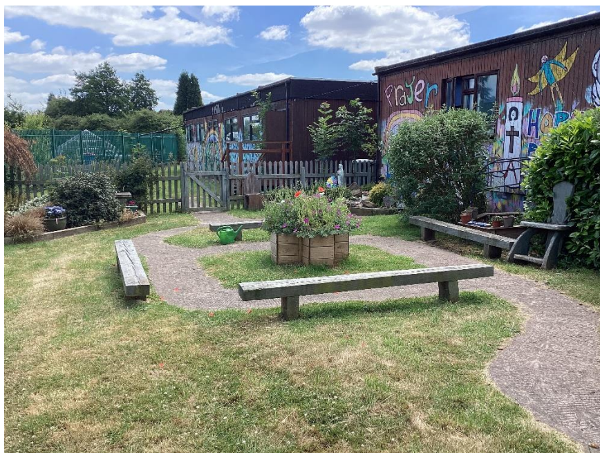
Our Prayer Garden

Our school is a Catholic school and has at its core the Gospel Values given to us by Jesus.