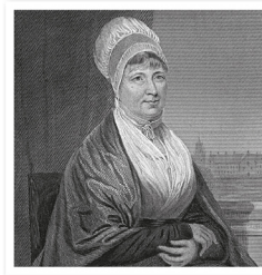
Elizabeth Fry helped poor and sick people.