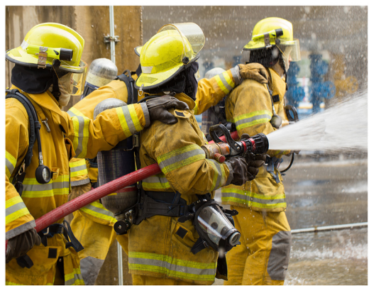
Firefighters are specially trained to help others in an emergency.

People who work in the local community help others in their daily lives, such as librarians or doctors. People who work for the emergency services are heroes because they risk their lives to help others.