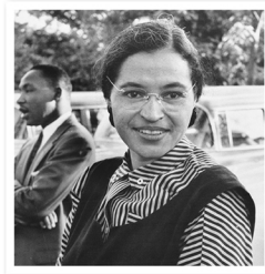
Rosa Parks stood for equal rights for everyone.

Many people in history have been real-life superheroes.