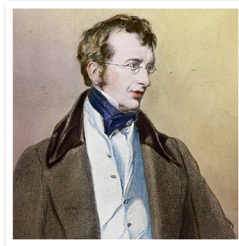
Thomas Fowell Buxton worked to improve prison conditions and ban slavery.